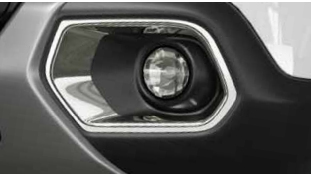
ELEGANCE PACK: CHROME#

#Elegance Pack (Chrome): Dealer Installed