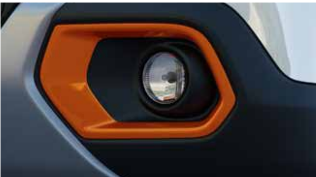
VIBE PACK: ZESTY ORANGE