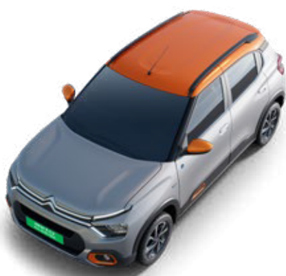
STEEL GREY BODY WITH ZESTY ORANGE ROOF