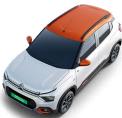
POLAR WHITE BODY WITH ZESTY ORANGE ROOF