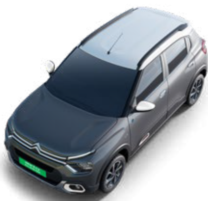
PLATINUM GREY BODY WITH POLAR WHITE ROOF