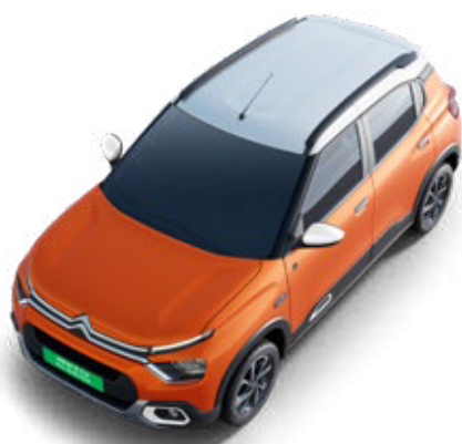
ZESTY ORANGE BODY WITH POLAR WHITE ROOF