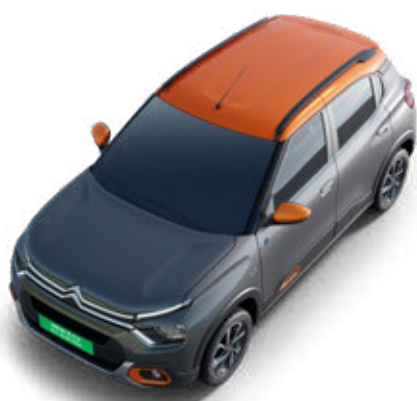
PLATINUM GREY BODY WITH ZESTY ORANGE ROOF