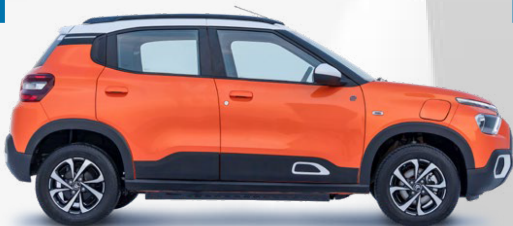
NEW ë-C3 ALL ELECTRIC