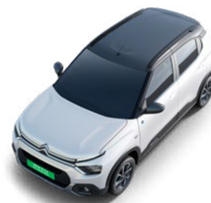
POLAR WHITE BODY WITH PLATINUM GREY ROOF