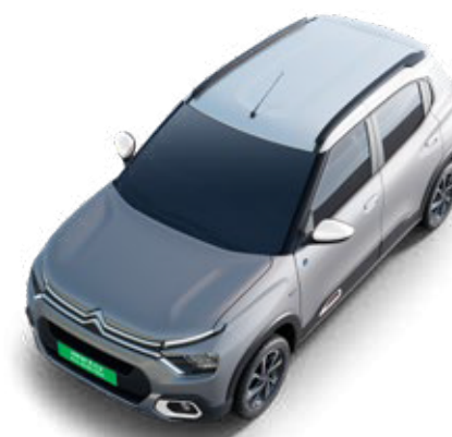
STEEL GREY BODY WITH POLAR WHITE ROOF