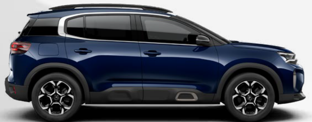
CITROËN C5 AIRCROSS SUV