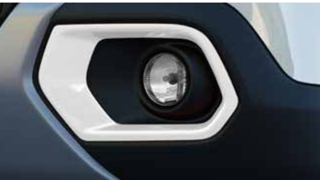
VIBE PACK: POLAR WHITE