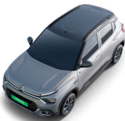
STEEL GREY BODY WITH PLATINUM GREY ROOF