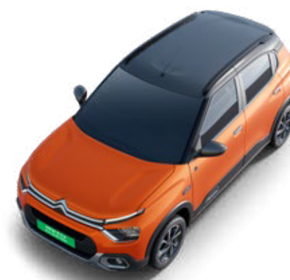
ZESTY ORANGE BODY WITH PLATINUM GREY ROOF